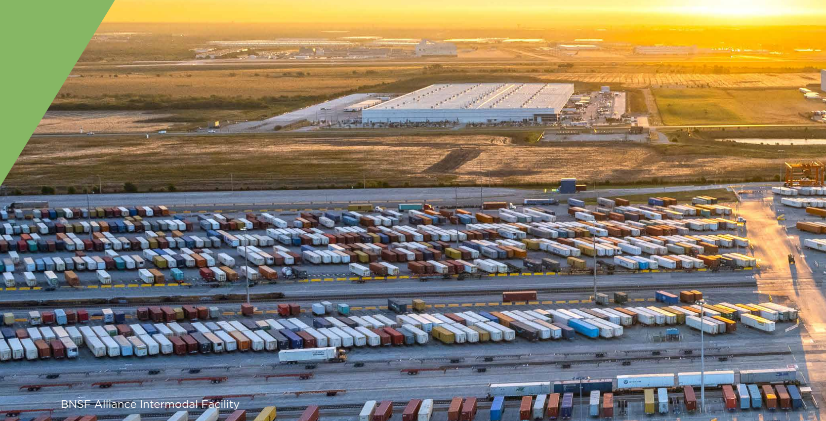
BNSF Alliance Intermodal Facility